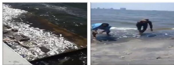
Figure 1. The fishermen do not go to sea because the fish are stranded on the coast in large quantities.

The research location is in North Jakarta, to be precise, on the coast of Muara Angke Bay, the coast of South Lampung, the waters of the south coast of Central Java, to be precise, Bopong Beach. The three locations are a natural upwelling phenomenon in which large amounts of fish are stranded on land.