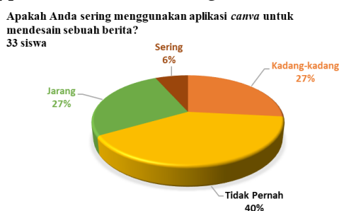
Diagram 2. Using the Canva Application for News Writing Design

only through print media but extends to electronic media. So that the news written is interesting, the writer must also pay attention to its appearance. One application that can be used to make news views more interesting is by using the Canva application. There are lots of display options (templates) that writers can use so that the news they write can attract more readers' attention when reading the news. The following are student responses regarding responses to using the Canva application for news design.