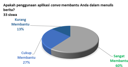
Diagram 3. Using the Canva Application Helps in Writing News

application. Most gave a positive response and there were some who felt it was less helpful. The following student response results can be seen in the diagram below,