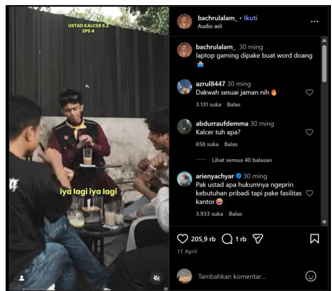
Picture 2. Instagram @bachrulalam Laptop gaming cuma dipakai buat word doang?

One of the most fundamental and innovative aspects of the hybrid da'wah model initiated by @bachrulalam is the construction of the preacher's identity and the redefinition of the da'wah space itself. This is not merely a marketing strategy, but a complex semiotic project aimed at overcoming the dissonance between the image of traditional da'wah and the preferences of contemporary audiences, especially the younger generation.