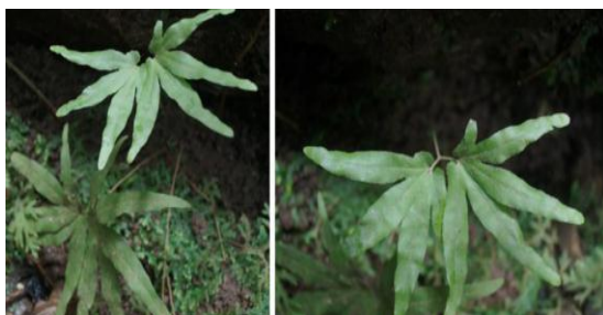
Figure 5. Lygodium flexuosum .