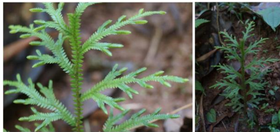
Figure 2: Selaginella selaginoides .