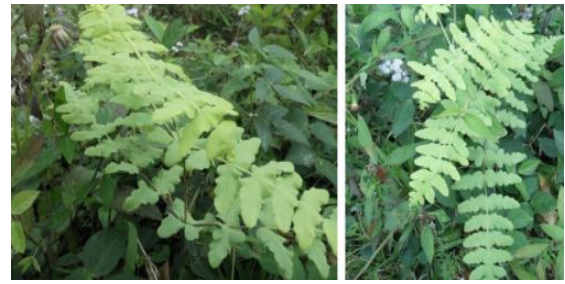
Figure 6. Histioteris insica .