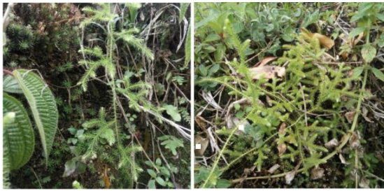
Figure 1. Lycopodium cermum .

Several species pictures of ferns found in Ancient Volcano Mount Nglanggeran.