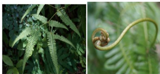
Figure 4. Dicranopteris linearis .