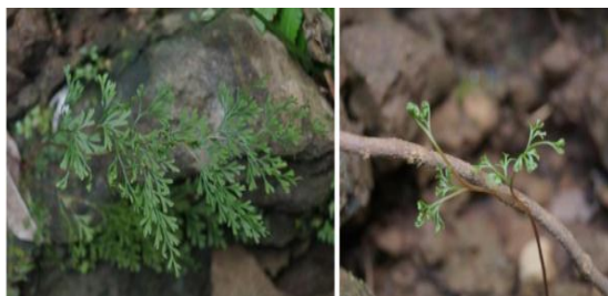
Figure 3. Trichomanes maximum .