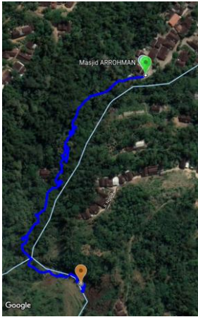
Figure 1. Location and track for collecting the data in Kedung Kopong, Salaman, Magelang.

observation location in Kedung Kopong is in the form of a river area and its surroundings. The water flow from Kedung Kopong is not too heavy, but it is clean so that it is widely used by local residents for their daily needs such as washing, bathing, etc. In the Banyak Angkrem area, there are several lands that have been used by the local community for gardening and raising fish. Some of locations in Banyak Angkrem have a higher light intensity than the Kedung Kopong area.