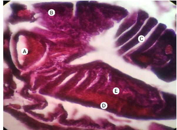
Figure 2. Histology of mudskipper gills (A) Artery, (B) Gill arch (C) Gill filaments, (D) Primary lamellae, (E) Secondary lamellae.

internal support (Roberts, 1989). Histology of mudskipper gills can be seen in the figure 2.