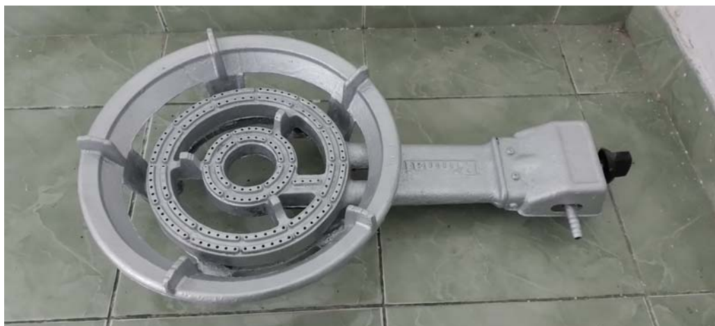
Figure 3. Stove After Paint