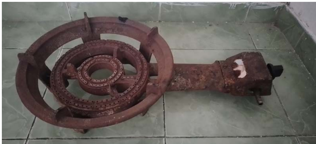
Figure 2. Stove that has not been painted