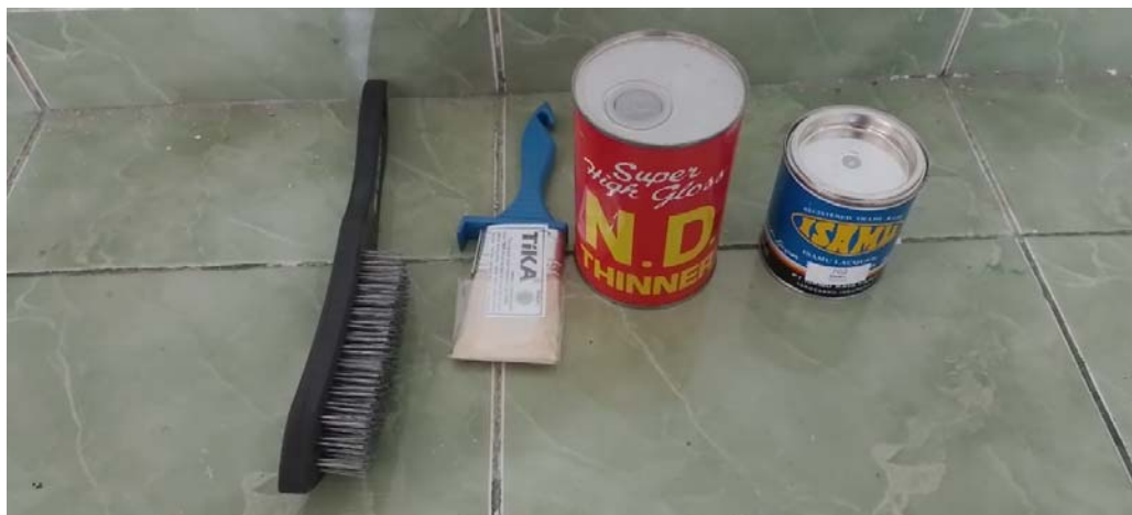
Figure 1. Iron Painting Materials