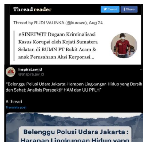
Figure 3. "Social Issue Discussion Thread"