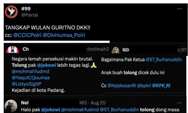
Figure 1. "Netizens engage in tagging actions."

Figure 1 illustrates how Twitter netizens in Indonesia consistently employ the practice of tagging prominent accounts that wield power and influence in addressing social issues. This includes official government accounts, political figures, law enforcement agencies, and prominent public figures. The research findings indicate that netizens have a strong understanding of which accounts have the capability to address specific issues. The results of the study suggest that netizens possess an exceptional understanding of the strength and potential of these prominent accounts in effecting change. They carefully consider the issues they