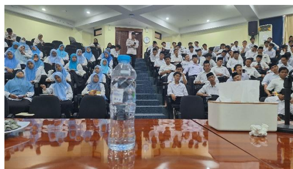
Figure 1. Questionnaire Distribution to 5th Semester Hadith Science Students of UIN Jakarta.

This research generally falls into quantitative, by analyzing the influence and implications of the Jāmi al-Kutub al-Tis'ah Application on Hadith students. While the area of this study was conducted on fifth semester Hadith Science students at UIN Syarif Hidayatullah Jakarta. The reason for taking this population is because the lessons of Takhrij Hadith and Hadith Technology are simultaneously studied in that semester. (Figure 1).