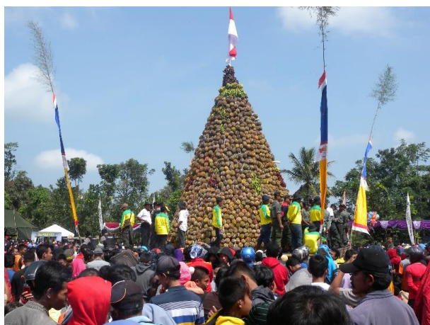
Figure 1. "Kenduren" culture in Jombang, East Java.

Based on the research conducted, it produces data on the results of a qualitative descriptive analysis. Figure 1 shows the "Kenduren" activities which were attended by local residents and outside the region. The author maps out the "Kenduren" activities associated with science material and Islamic religious education in Figure 2. The results of a detailed description of the material can be seen in Table 1.