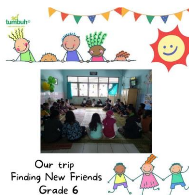
Figure 5. Solidarity Activity

The activities held by SD Tumbuh 1 Yogyakarta are not only limited to those in the school environment. However, interacting and providing social assistance to orphanages. The purpose of this program is for them to have a sense of care that is