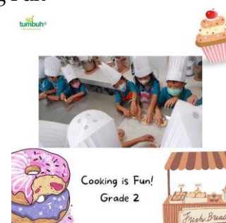
Figure 1. Cooking Activity.

This activity is one of the inquiry projects from class 2. Their activities saw and practiced the steps to make donuts in one of the market places, namely mimiroti cakery yogyakarta. The cohesiveness they display with teammates whether they have