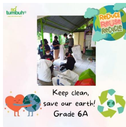
Figure 4. Triple "R" Activity

Reduce, reuse, and recycle are activities for processing and selecting waste based on its type such as paper, plastic, bottles, and so on. After that, it does not arrive to be collected in one place, but also sells it to collectors/buyers. This activity can train and utilize the waste at home to be worth rupiah.