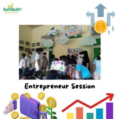
Figure 3. Entrepreneurship Activity

This activity has clearly provided an overview of entrepreneurship sessions in the SD Tumbuh 1 Yogyakarta environment. On this occasion, children are given space to present their products to other classes. They communicate and cooperate with each other without any limitations.